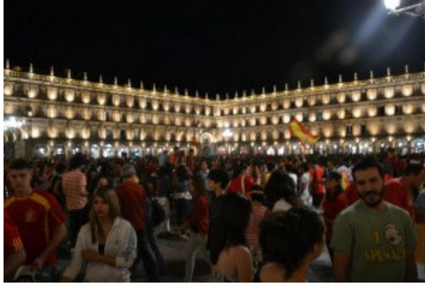
Locals celebrating in Plaza Mayor when Spain won the Euro 2012.

USFSP also provided us with guided tours through other cities in Spain and put together cultural events like watching traditional flamenco dancing. I was in Spain when it won the UEFA Euro 2012 and I've eaten almost every traditional meal the country has to offer. I didn't just get to learn the language, I was a part of Spanish culture too.