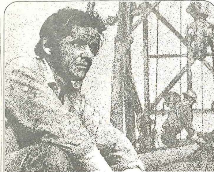
"Keep on tellin' me about the good life, Elton, because it makes me puke."