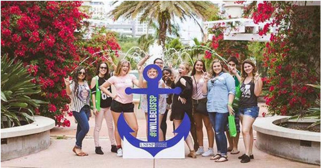
New USFSP students and their families attended "Anchor" on April 1.

Partners from across the USFSP community joined together to welcome nearly 120 admitted students and 163 guests to the campus at the fourth annual "Anchor" event. Anchor, which aims to prepare new students for orientation and their first day of classes, was developed in response to parent feedback. It serves as a way for students and their families to get answers and experience campus life before Move-In Weekend.