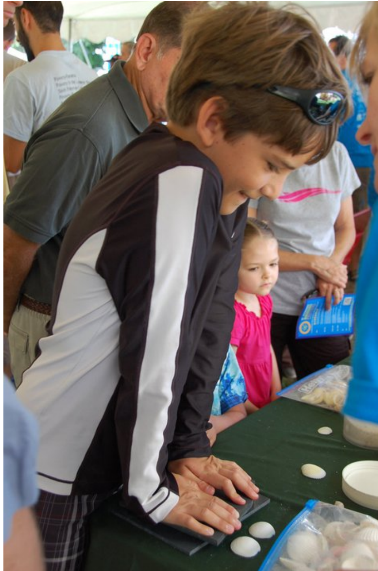
Having fun at last year's SciFest.