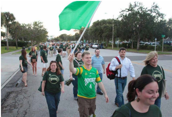
USFSP Night at the Rowdies 2014

Join USF St. Petersburg and members of the St. Petersburg community in supporting the Tampa Bay Rowdies as they take on the Carolina RailHawks at Al Lang Stadium on Saturday, Oct. 24, at 7:30 p.m. Admission is $10 with a USF ID, and tickets can be purchased online with the promo code USFSP15. This offer is limited to two tickets per ID presented at the box office.